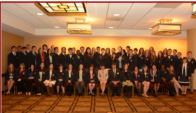
The 2015 Voice of Democracy winners during their awards ceremony in Washington, D.C.